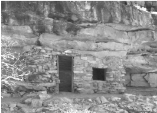
[Beamer Cabin – photo courtesy NPS, 2002.]

First, Amy explained about the Vanishing Treasures Initiative. Beginning in the 1990s, there were many retirements of skilled masons. Ruins stabilization began to suffer, so Congress passed a measure that used skilled seasonal employees to fill positions. Prehistoric ruins were assigned as specific projects to stabilize. The structures targeted were standing structures that were not being used for their original purpose.